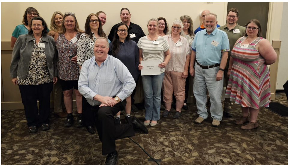
Thank you, Washington Stewards! Pictured here are the stewards in attendance at the State Convention in June.