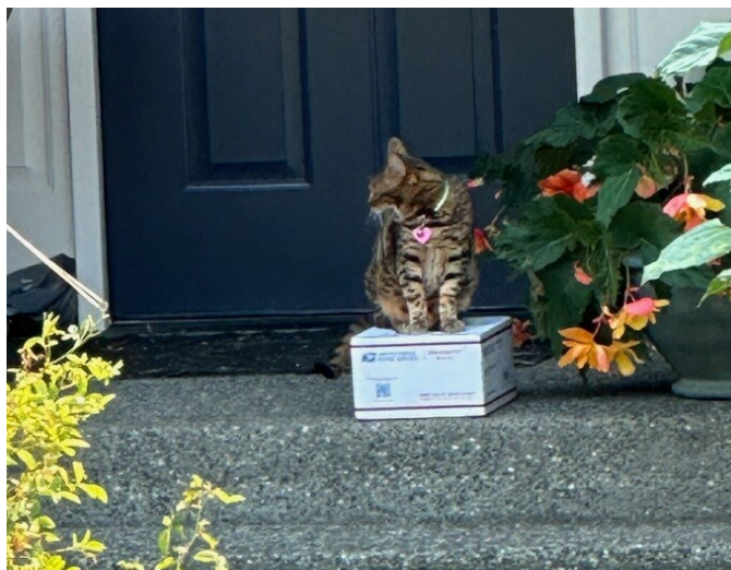
If I fits, I sits.

Learning new things and growing as a person can't happen without getting a little uncomfortable